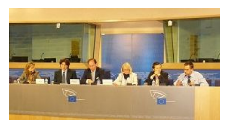
NTDTV, Reporters Without Borders, International Press Alliance, and Members of the European Parliament hold a joint news conference

(Clearwisdom.net) On July 15, 2008, New Tang Dynasty Television (NTDTV), Reporters Without Borders, the International Press Alliance, and Members of the European Parliament held a joint news conference. They condemned satellite company Eutelsat's termination of NTDTV broadcasts in Asia, particularly at this time right before the Beijing Olympics, and asked the European Union and the Government of France to put pressure on the French satellite company to comply with European human rights standards, democracy, and law, and to restore the NTDTV signal as soon as possible. Many officials in the European Parliament and media participated in the conference.